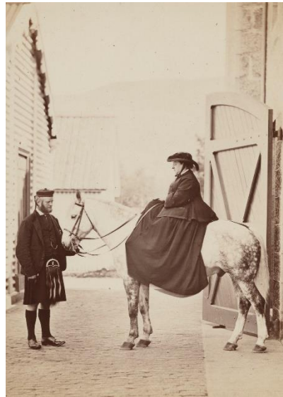
Queen Victoria & John Brown 1868

considered the Queen a kept woman or, as with Bertha Mason and Grace Poole in Jane Eyre , that John Brown was a mad person's attendant.