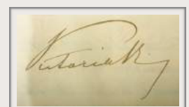
Signature of Queen Victoria

Design your own fancy and distinctive autograph to sign off